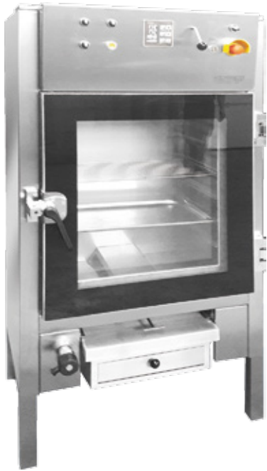
CS 350, semi-automatic